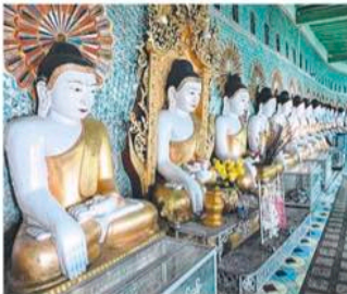
eight-nights and include the Chobe National Park, Savuti, Okavango Delta and Nxai Pans National Park. Guests will stay in dome tents with ensuite bathrooms and separate toilets. The tours will run from February. See andbeyond.com